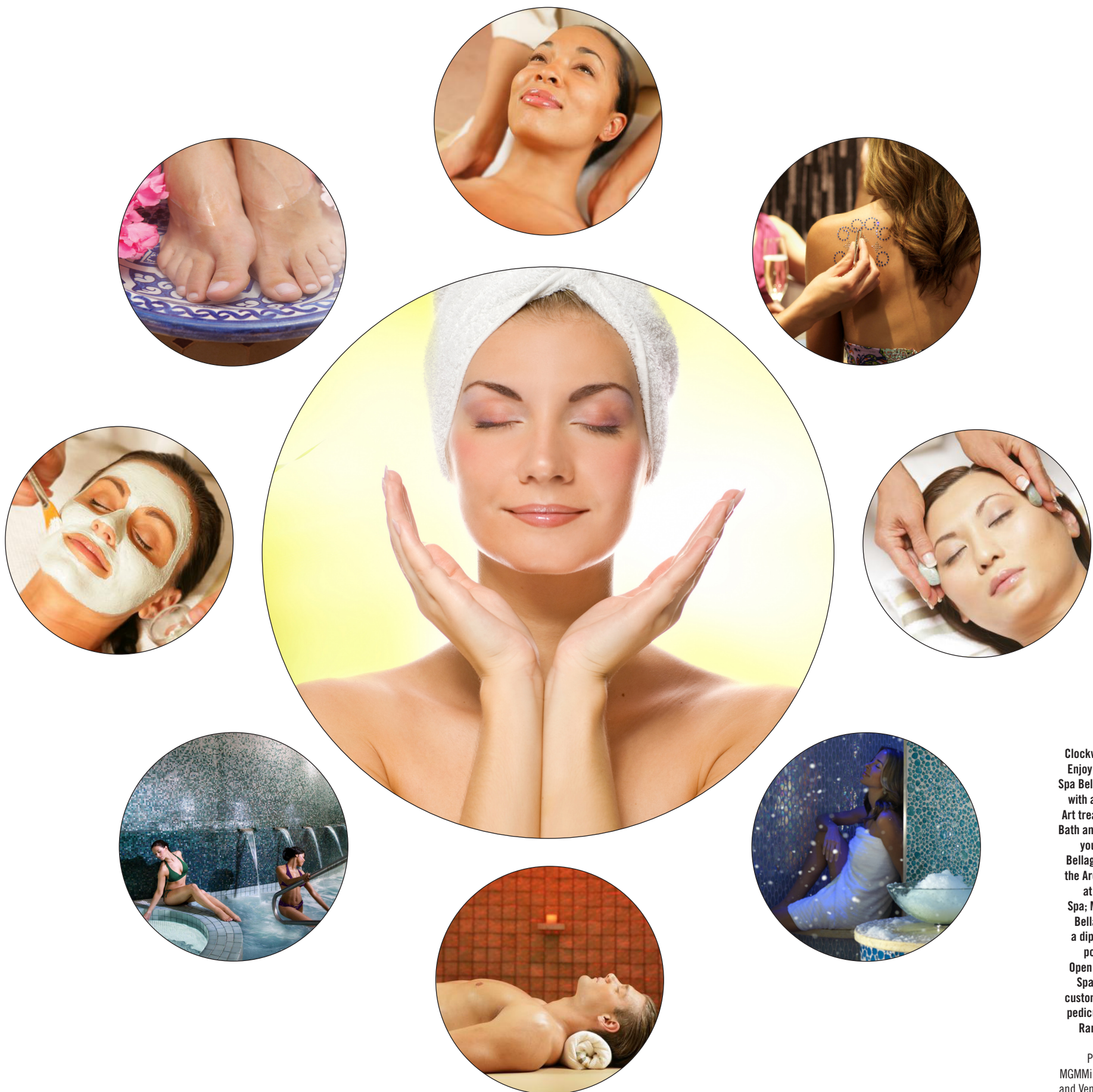
Clockwise from top, Enjoy a massage at Spa Bellagio; Sparkle with a Crystal Body Art treatment at Qua Bath and Spa; Soothe your eyes at Spa Bellagio; Cool off in the Arctic Ice Room at Qua Bath and Spa; Men enjoy Spa Bellagio too; Take a dip in the plunge pool at Nurture; Open your pores at Spa Bellagio; and customize your own pedicure at Canyon Ranch Spa Club.